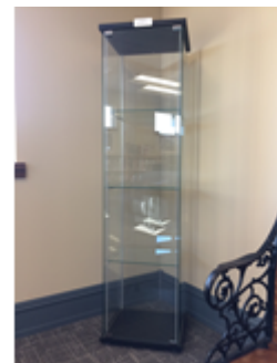
Shedden's Glass Display Case

Drop in to receive your free comic book and also participate in our Super Hero - Super Reader Contest for your chance to win one of 2 Free Comic Book Day Prize Packs!